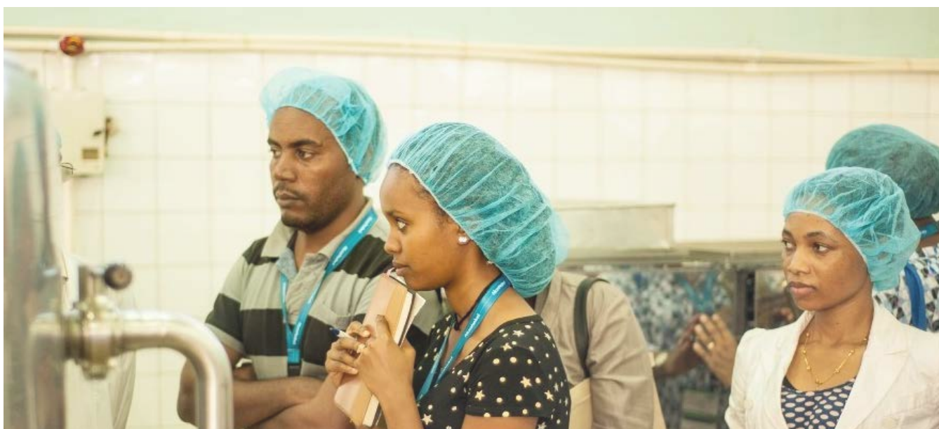
Participants in the Quality Assurance/Quality Control workshop in Uganda visited a Bakhresa Flour Mill (above) and a Uganda National Bureau of Standards analytical laboratory to see monitoring steps being conducted.