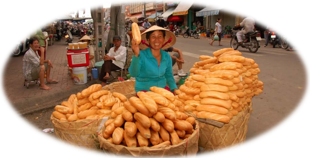
Viet Nam was among the countries that passed mandatory legislation for grain fortification in 2016.