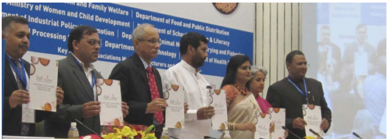
Leaders from various government ministries in India launch draft fortification standards and a logo for fortification during an October 2016 National Summit on Fortification of Food.