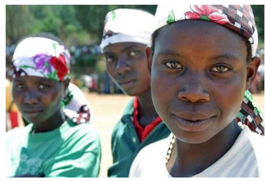
Burundi

Project Healthy Children (PHC) is a leading local partner in both countries.