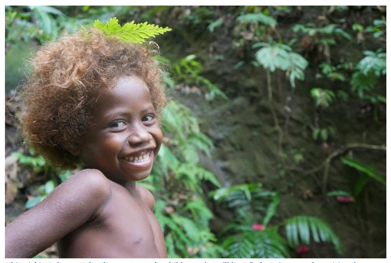
This girl in Solomon Islands represents the children who will benefit from improved nutrition due to fortification.