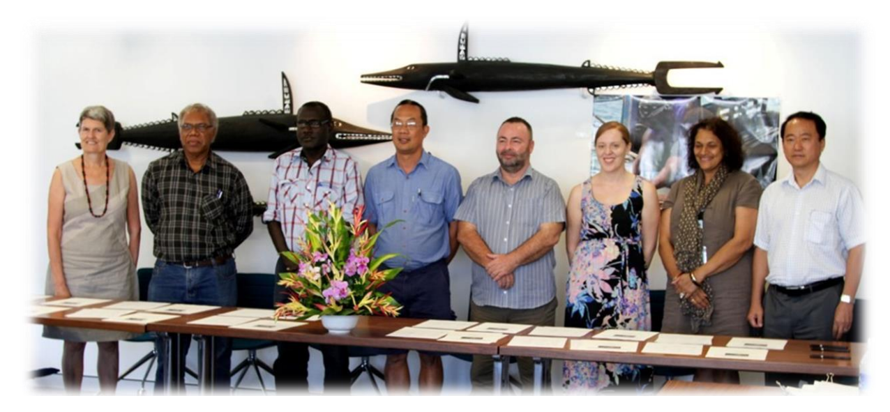
Signatories of the national memorandum of understanding for food fortification in Solomon Islands pose for a photo during the first Food Fortification National Committee meeting in February 2015.

company is willing to fortify its products if fortification becomes mandatory and is fairly monitored. Adequate monitoring will create equitable financial obligations among rice importers and help ensure equal coverage of nutritional benefits for consumers.