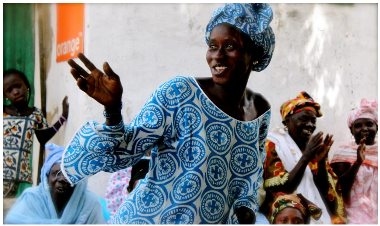
Costa Rica, Fiji, and Senegal are among the countries that have reported declines in anemia since fortifying flour.

On the cover, the left photo was taken in Costa Rica by <u>Sean Norton</u>. The right photo was taken in Fiji by the Australia <u>Department of Foreign Affairs and Trade</u>. On this page, the photo from Senegal was taken by <u>Rob Baird</u>. Each photo is from Flickr with a Creative Commons license. 'Defeating Anemia' title is from an article in the third quarter 2015 issue of Milling Journal and used by permission.