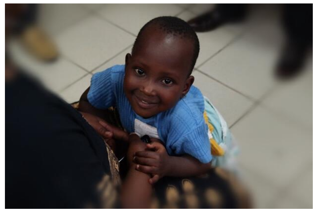
This child with spina bifida was at the Plaster House rehabilitation center near Arusha, Tanzania, in September 2015 when participants from the #FutureFortified Global Summit on Food Fortification were visiting. The Summit participants also toured the Arusha Lutheran Medical Center to better understand what children with spina bifida experience.